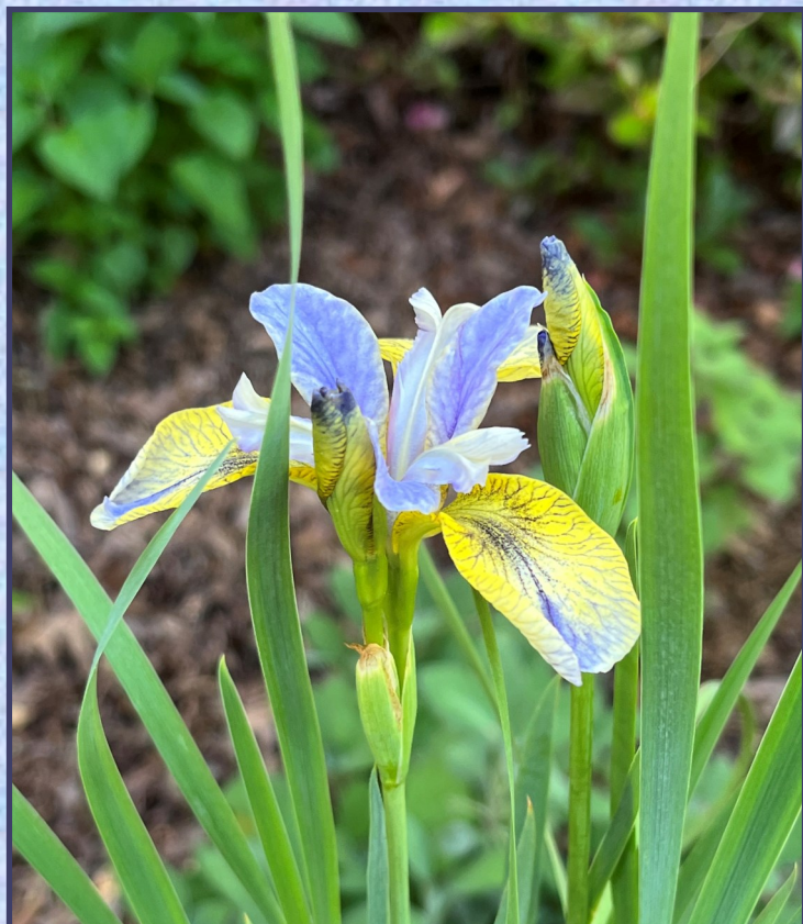
Iris siberica ' Tipped in Blue'