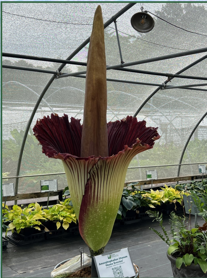
Avent aroid in flower

These two titan aroids are the 808th and 812th known to have bloomed in cultivation, since the first one at the Royal Botanic Gardens, Kew, in 1889.