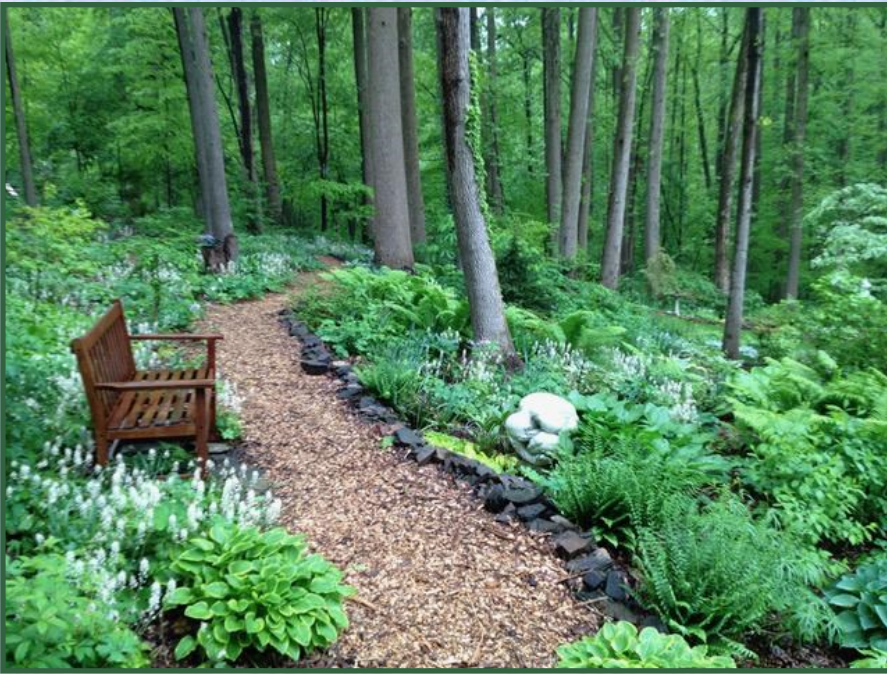
Rest for meditating with Shy Yogi of Bali