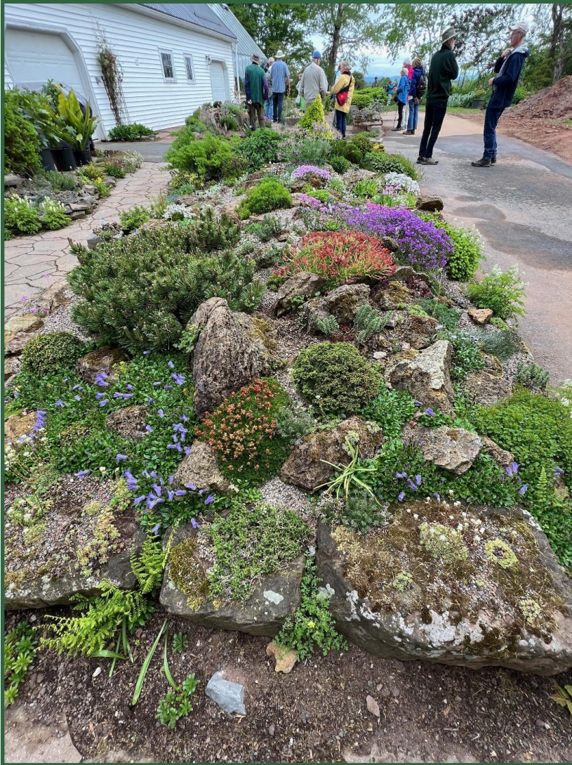
Darwin Carr's rock garden.