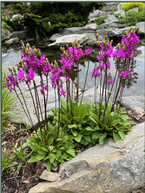
. Dodecatheon (now Primula ) pulchellum 'Red Wings'