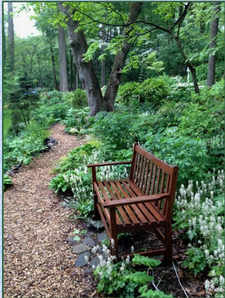
Rest filled walkway with Tiarella cordifolia

It was featured in the Oct/Nov 2010 edition of Signature Brandywine Magazine and selected as best garden in Delaware County, PA in 2010.