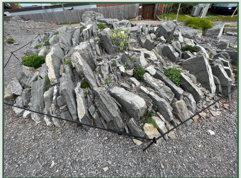
Crevice Garden at Dalhousie Rock Garden