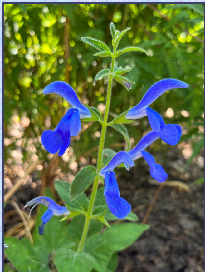
Salvia patens ' Blue Angel'