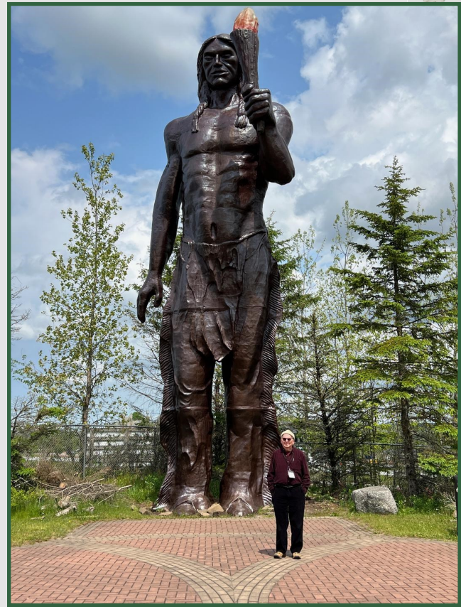
Glooscap of the Mi'kmaq First Nation (Native American) was the first human, creating himself, according to legend, and made the world inhabitable by creating mountains and rivers.