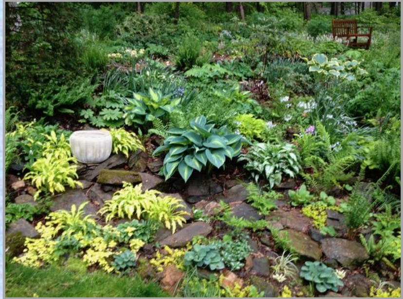
Outcropping and Spring