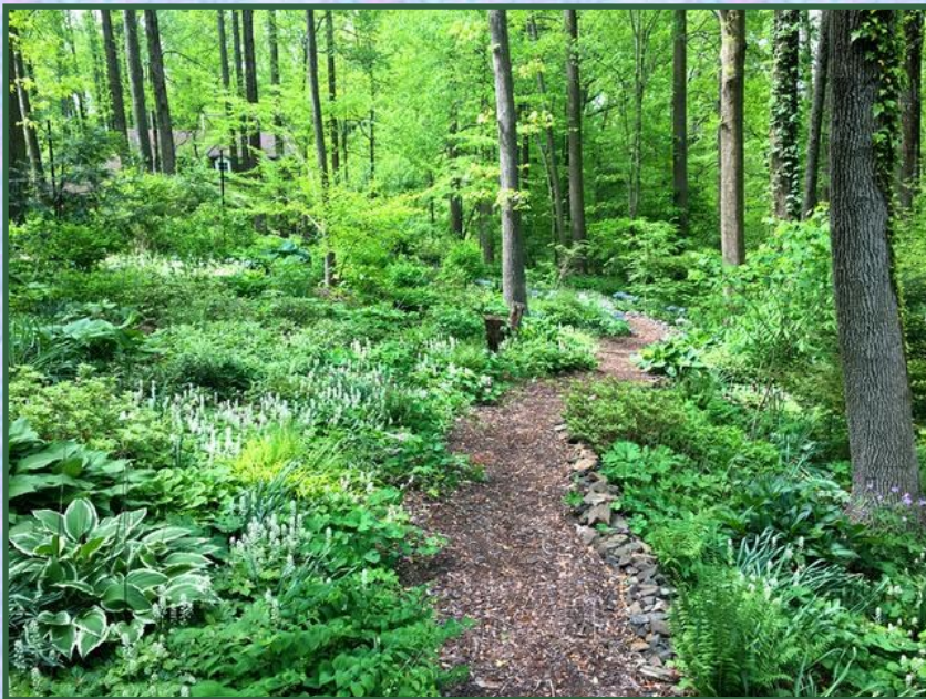
Winding Way Trail