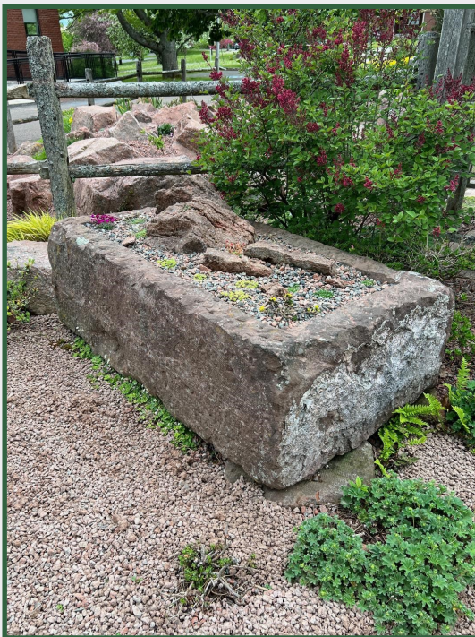
Stone trough cut by local stonemason at Dalhousie Rock Garden