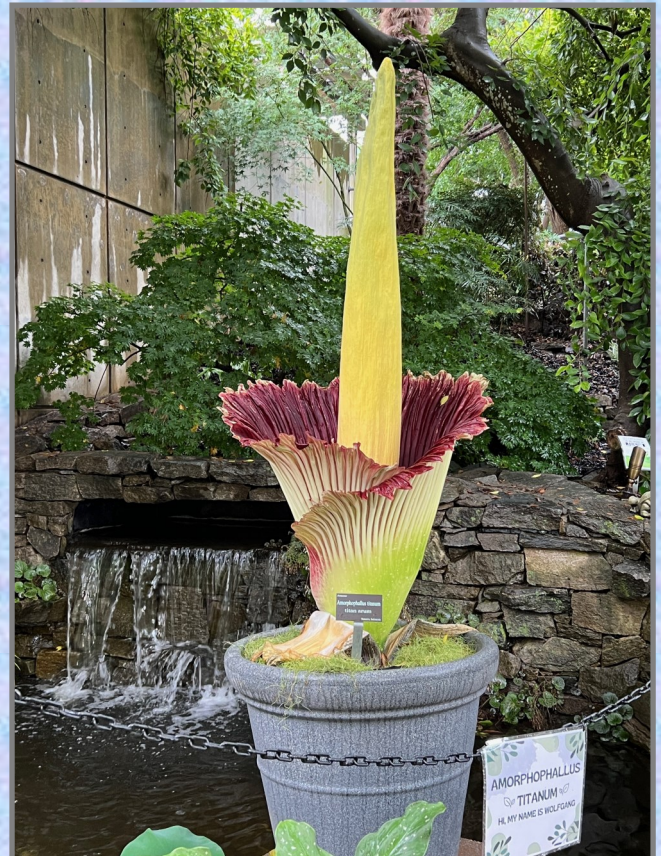
JCRA aroid in flower