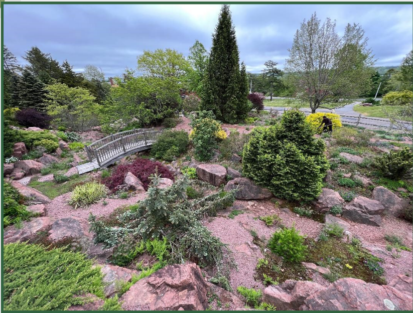
Dalhousie University Bicentennial Rock Garden with pink granite