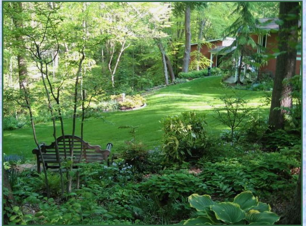
Beloved place to sit, meditate and drink wine