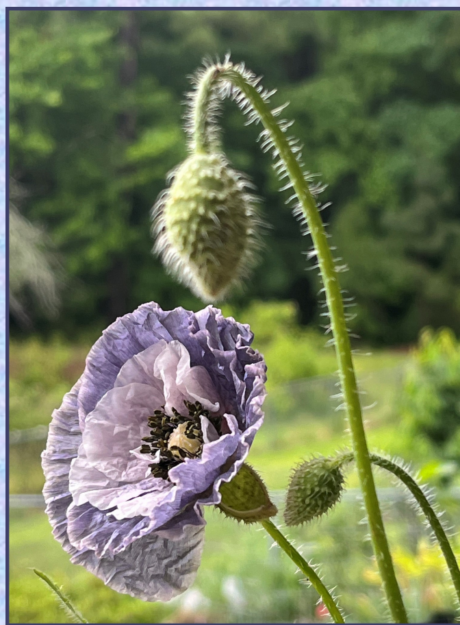
Papaver rhoeas ' Amazing Grey'