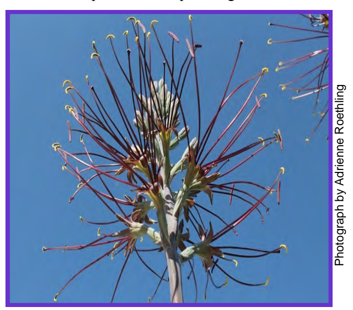
Manfreda undulata 'Chocolate Chip.'

If you like growing cactus without all the pain, try Manfreda . Manfreda are deciduous agave relatives that flower every year once established, unlike their evergreen counterparts who flower approximately once every 10-15 years (in NC). A new one to hit the gardening world is Manfreda undulata 'Chocolate Chip.' The low spreading rosette of