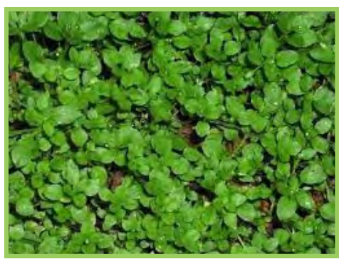
Stellaria media (chickweed

September is the anniversary of Hurricane Fran's visit to the Triangle in 1996. Fran taught me a thing or two about weeds when it brought down thirteen large deciduous trees in the garden. The shade that disappeared with the trees provided just the environment for unwanted plants whose seeds lay dormant in the shade, perhaps for years. The first season after Fran, the comely pokeweed (Phytolacca americana) popped up by the hundreds, producing messy berries that were enjoyed by, but further spread by birds. After controlling pokeweed, two years later the soil pro-