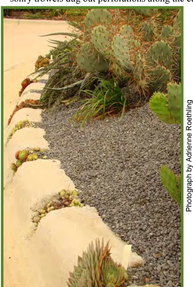
Curb cutouts filled with hens and chickens

Begun at ground level, the pouring of a curb defined the twin garden spaces. Construction crews using masonry trowels dug out perforations along the curbing every twelve inches before the concrete had a chance to