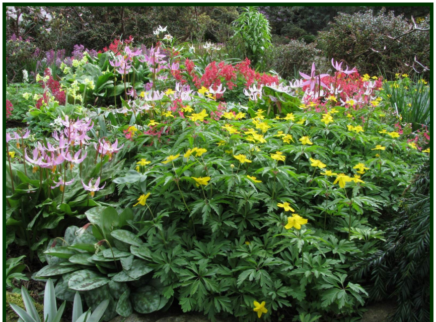
Bulbs in the Garden

Fritillaria pallida in particular is a wonderful garden plant gracing the beds with its multiple large hanging bells of straw yellow with deep purple spots in the centre growing side by side with Fritillaria pyrenaica , F. tubiformis , F. acmopetala and many others. Over the years we try more of the Fritillaria that we have grown under glass in the open garden and to date have always been pleased to watch how well they grow when released – embarrassingly they sometimes grow better in the garden where they do not have to rely on our attention. For a number of years now we have been trialling growing bulbs in beds just sharp sand with amazing success –