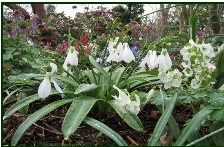
Photograph by Ian Young

The blooming of Eranthis hyemalis in the