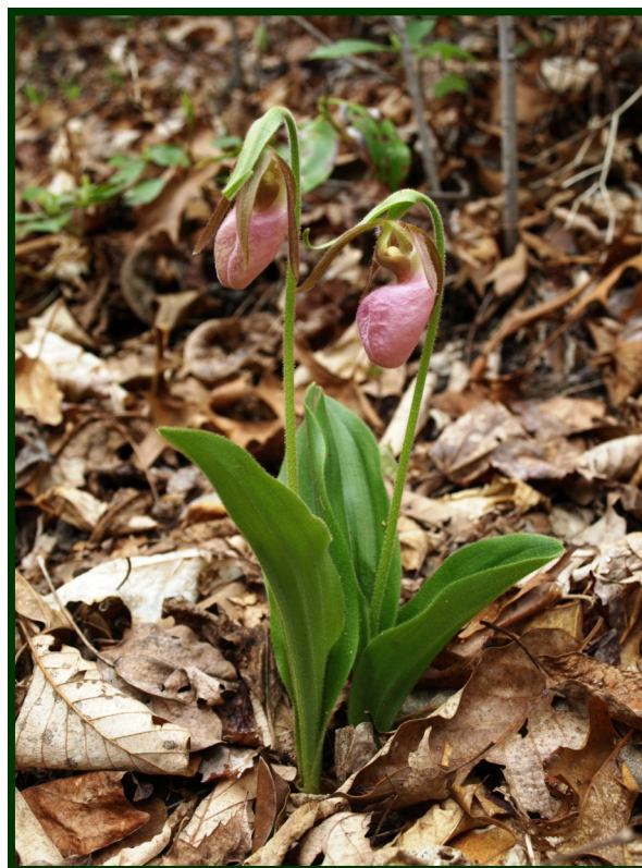
by Tim Alderton

The hike offered just a sampling of the flora to be found on that day in the Blue Ridge. Had we been at another location an entirely different collection of the flora would have been found. Even if one revisited the same trail at a later date, one would not find the exact species we saw that day. Numerous hikes may provide an idea of the true diversity of the flora to be found in the Carolinian Forest of the Blue Ridge, but seeing the full breath of the flora could take a lifetime. ☞