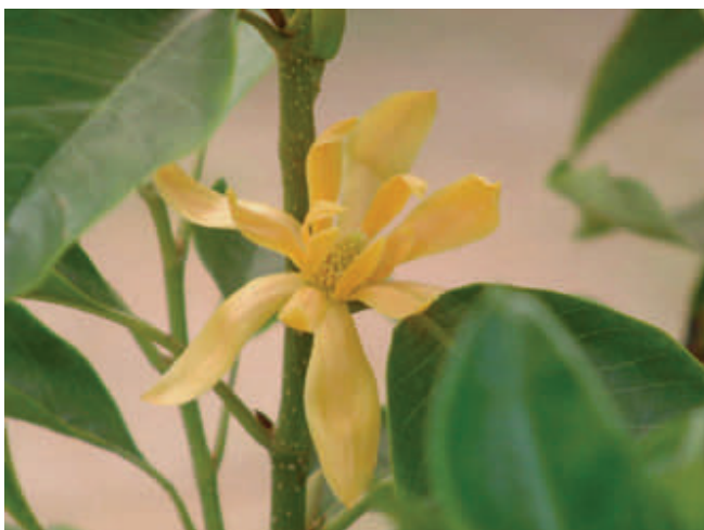
Magnolia champaca flower and seed pod

NC has offered a variety of them but they sell out rapidly. One problem is that they are generally difficult to root from cuttings. They grow readily from seed but most seed sources are in Asia with the usual accompanying