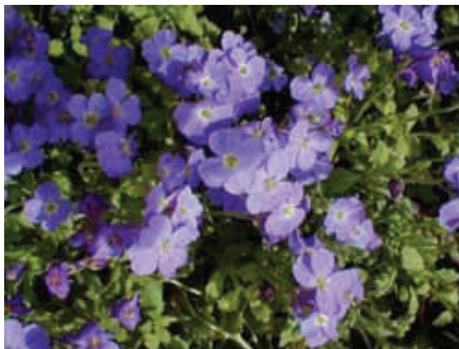
Aubrieta 'Cascade Blue'

15' feature for some of these small plants. I'm going to search for some limestone rocks (indigenous to the Ken-