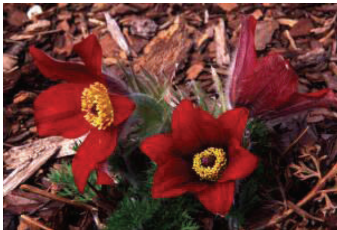
Pulsatilla vulgaris 'Rote Glocke'

One idea I'm entertaining for this spring is turning over a small spot on one end of a perennial border into a 15' x