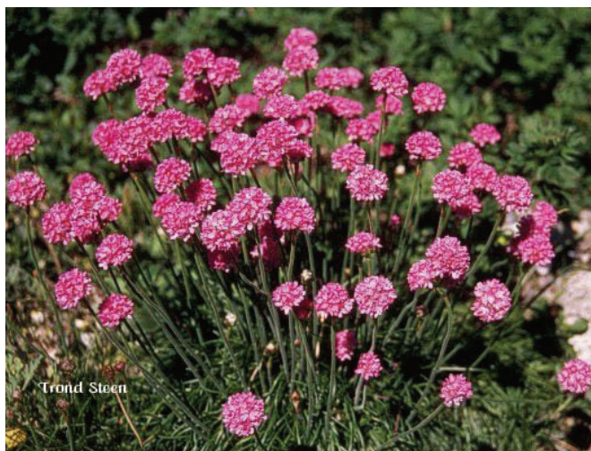
Armeria maritima 'Splendens'

What's on my plant wish list? First, I'm thinking of some easier ones, yet plants that I wouldn't want to be without. And these are versatile enough so that they could be planted in the front of the garden, on walls, in the rock garden or in containers. I'd plant the early flowering