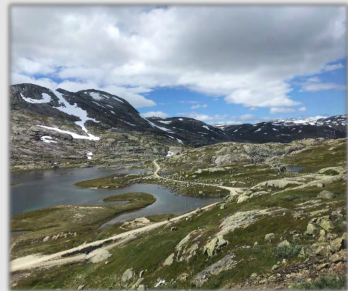
Gol Plateau, Norway

With its harsh climate the terrain is essentially treeless moorland, sprinkled with lakes, ponds and a few glaciers. We passed through all too quickly by train, so I’m hoping to return to explore this piece of alpine tundra in southern Norway. We did manage a short side trip to a couple of fjords, even more spectacular than they appear to be in photographs. By the way, Naturetrek, the British company that conducted a NARGS tour of the Italian Dolomites, also offers a tour of the Gol Plateau.