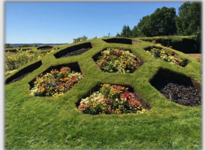
Soccer Ball Garden at Sofiero, Sweden