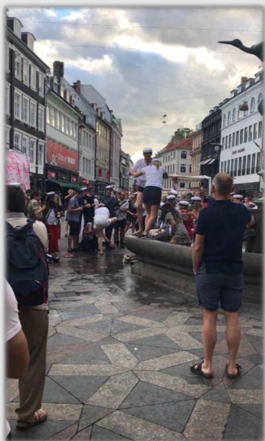
High School grads in fountain, Copenhagen