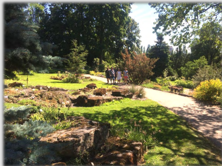
Rock Garden at Oslo Botanical Garden

Traveling west from Oslo to Bergen by rail, we traversed the mountainous Gol Plateau