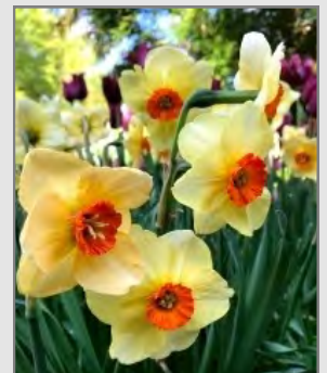
From John Scheepers online catalog