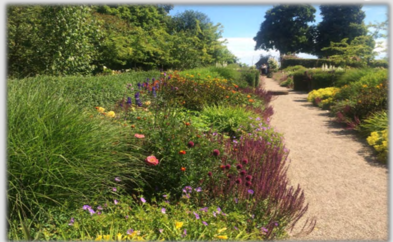
English Garden at Kivik, Sweden