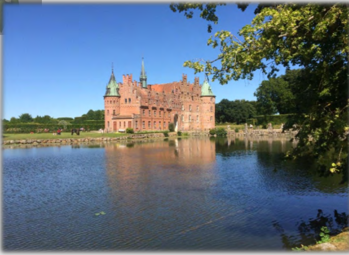
Egeskov Castle, Copenhagen ("Seen one castle..." but still quite impressive)

peaking from mid-June through mid-July. As the roses fade, 140 varieties of dahlias come into their own. You could easily enjoy a full day here, spending the night at one of the coastal towns nearby.