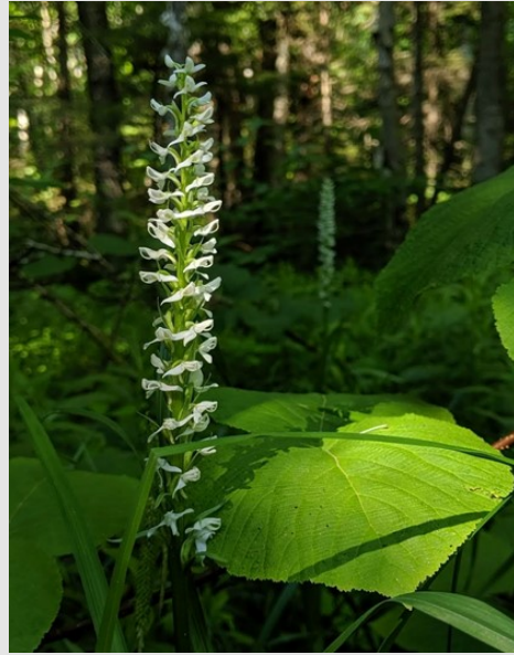
Platanthera dilatata was the first plant that didn't key out in our Weakley's Flora. From this point on, we knew we weren't Kansas anymore

lilies. The forests, especially when we began to regain elevation as we headed into Vermont, became much more coniferous in nature. Shrubs and wildflowers suddenly were appearing around us that I was unable to key out in my out in my Weakley's Flora, which had faithfully served us for as long as we were within its jurisdiction of the southern and mid-atlantic states. Orchids, which had been sparse on the journey thus far, were becoming more and more common to see. Ericaceous herbs beyond pipsissewa, including moneses and pyrola were dotting the forest floor. Summiting moosilauke, the first of New