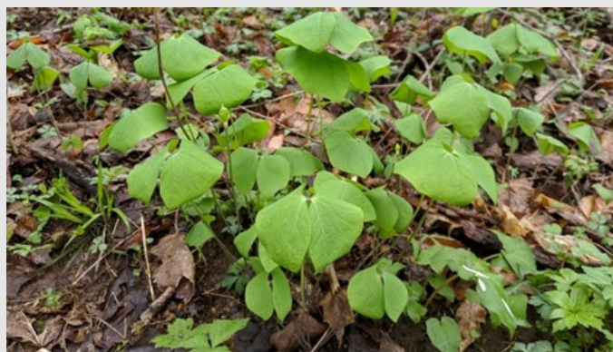
One of the most exciting discoveries of the trail, this was one of two patches of Twinleaf ( Jeffersonia diphylla ) that we came across in Virginia.

To be enveloped by spring each day as you wake up and walk along a mountain trail was electrifying. Every day, I knew we would be finding new treasures potentially at every turn, all the while being treated to some of the most miraculous landscape views in North America. From the Smokies, we quickly crossed over Max Patch, the Roan Highlands, Grayson Highlands, and into the Washington and Jefferson National Forests. By the time we got to the James River in early May, we had seen everything from skunk cabbages to Catawba rhododendrons flowering on the trail. The first seven hundred miles had delivered more to us in terms of plant diversity than