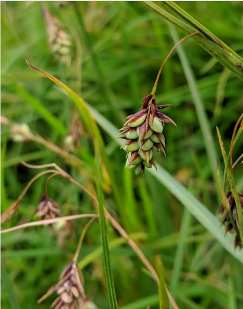
Carex magellanica , one of the many species of sedge that were present in the bogs of the northeastern section of the trail.

While the diversity of the flora in the northern section of the trail was perhaps slightly less than what we had encountered in the south, the variety of habitats that were new to us kept us on our toes all the same. We came across our first bogs, filled with sundews and pitcher plants on sphagnum laden shores. Beaver ponds that were ringed with spiraea, viburnum, and Ericaceous species held large mats of floating spatterdock and water