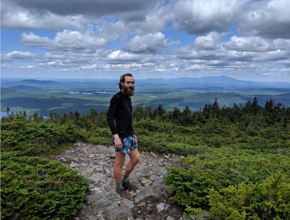
One of the reasons why the views were so hard to beat in Maine. This was the first glimpse of Katahdin, just under halfway through the 100 Miles Wilderness.

The last few hundred miles of Maine were similar to what we had seen since Vermont. Vast coniferous forests between treeless summits dotted with mats of alpine plants, interspersed with occasional mountain top bogs colonized with eriophorum, platanthera, rubus, drosera, carex, and more. I marveled at them as I had been doing along the whole trail, but for the first time for me, the views were actually taking the place of the most beautiful sights of the hike. The wilderness that we experienced in Maine was unmatched anywhere else on the entire trail. I remember thinking about how John and William Bartram would have seen all the landscapes that we had seen as we