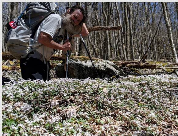
Dad stopped to admire the carpet of Claytonia virginica we walked through for over a week in Tennessee during the beginning of spring.

with a fury. As we passed through Davenport Gap at the northern end of the Great Smoky Mountains National Park, we were greeted with trout lilies, toothworts, miterworts, cohosh, bloodroot, bellworts, and everything that we had been scanning the ground for over the first two hundred miles. From this point on, it didn't really slow down!